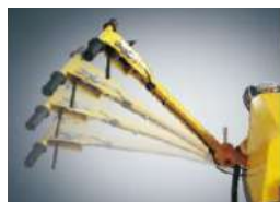
Variable height adjustment for operator's comforts