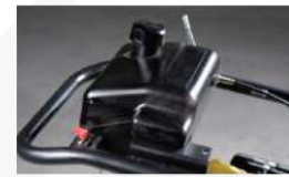
Durable plastic oil tank