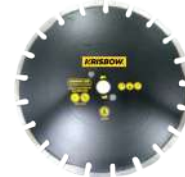
Cutter Asphalt-Concrete 14"